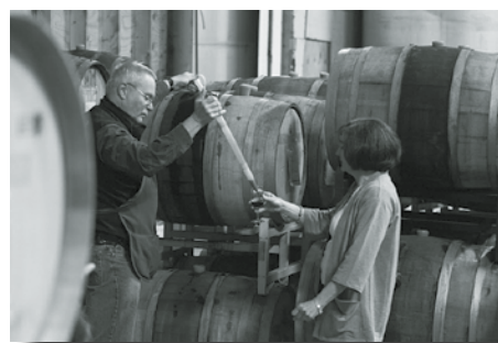
Wine sampling from a barrel on a cellar tour.

More information about our cellar tasting tours is available on the website: www.fennvalley.com .