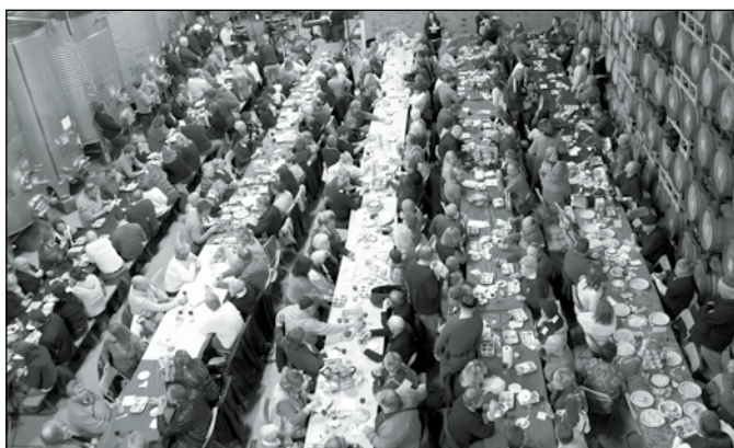
More than 520 people gathered to enjoy the sounds of The Trace and sample the myriad of chilies entered in our 13th annual Chili Cookoff.