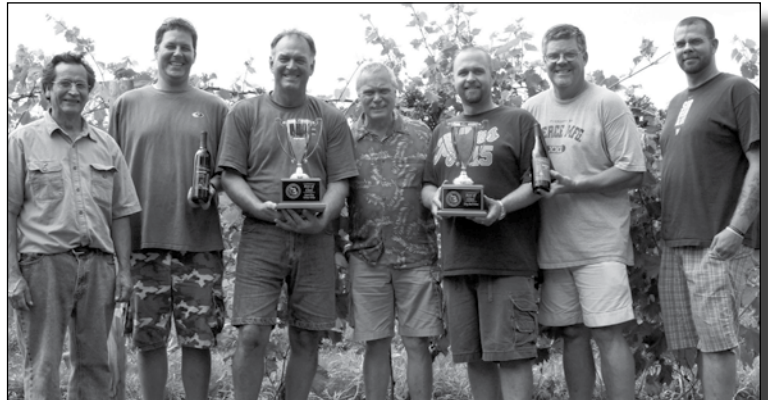
The winemaking crew holding best of class awards

Both wines are available for tasting and purchasing at our Fennville and Saugatuck tasting rooms. Come on in and check out what judges believe to be some of the best wines in the state.